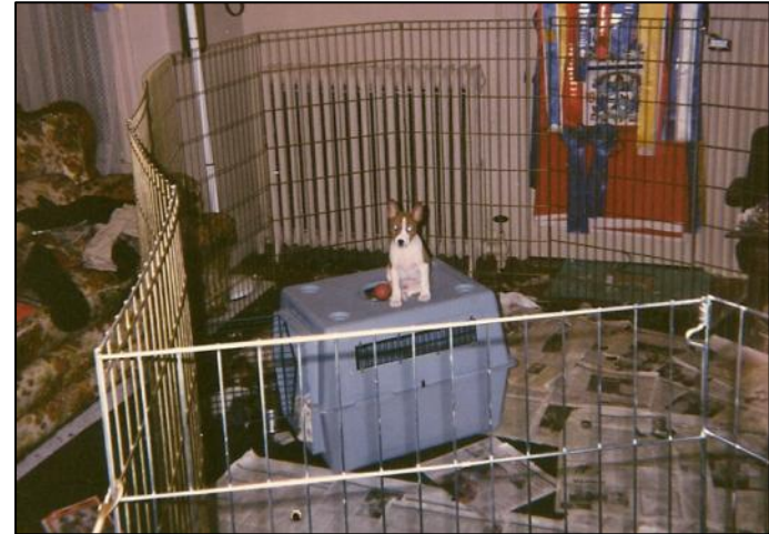
A smaller pen with a lid would be better as even very young pups sometimes climb well