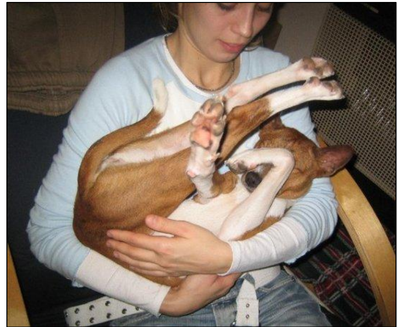
Your Basenji should be relaxed about how people handle him.

Any nipping, possessive or aggressive behavior toward people should be dealt with immediately. Again, if you do not understand the psychological interactions of dogs and people, find more information on the subject and learn how things should be done. There are books and websites with this type of information. Help finding trainers can be found in the section #104 Books To Read where some breeders have offered links that may be useful. A local puppy kindergarten class may help you learn to control your puppy as well as helping with socialization.