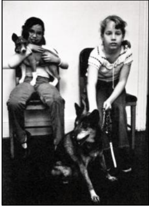
The Basenji April 1983